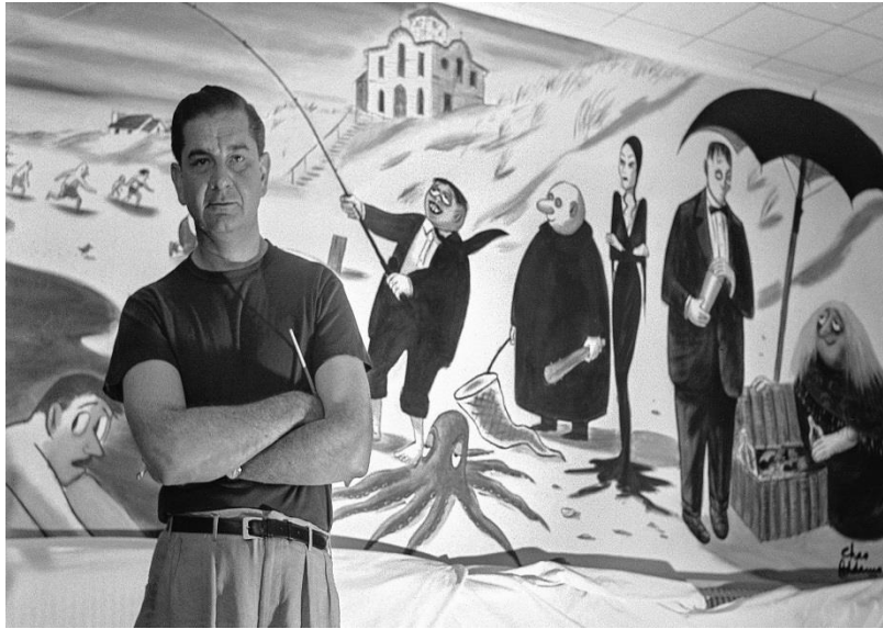
Charles Samuel Addams